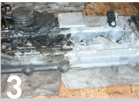
Removed valve cover. Left: untreated. Right cleaned with Cold Spray, LIQUI MOLY Pro-Line Injector and Glow Plug Dismantling Aid and engine wash.