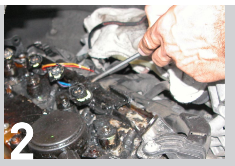
Scrape off and respray several times. Then give the engine a thorough wash.